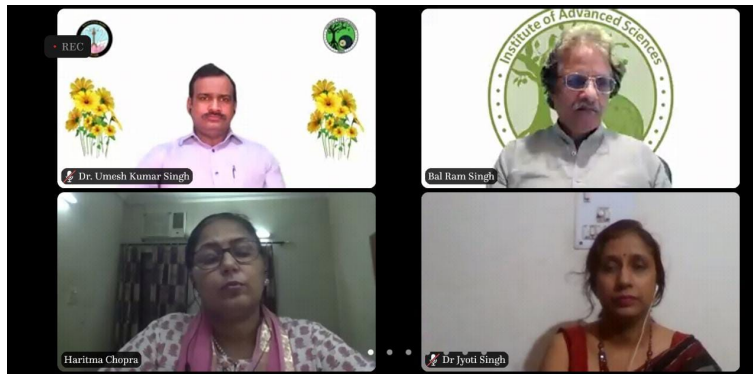
Figure 6: Some members of Organizing Committee