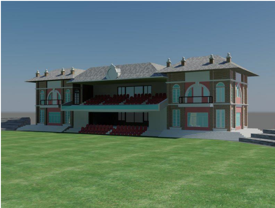
Maska Cricket Academy with Meckony Pavillion, A facility generated in a village for underprivileged children of villages and nearby who aspire for sports. It has world class gym and a small space for gymkhana. 2010-13